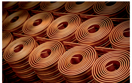
The Bourdon spring