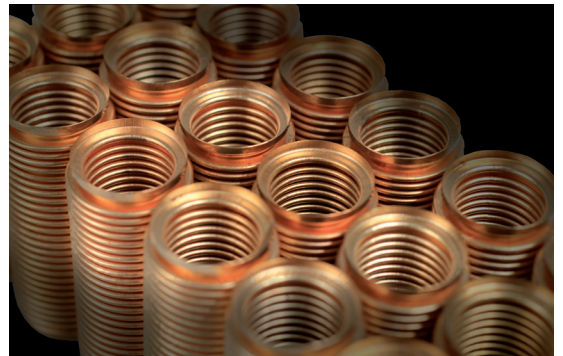
The bellow-type technology

Both the bellow-type and Bourdon technologies are characterized by maintenance-free, robust measuring principles with a low tendency to develop faults, offering impressive reliability and longevity. The innovation, quality and service you would expect of MESSKO still come as standard.